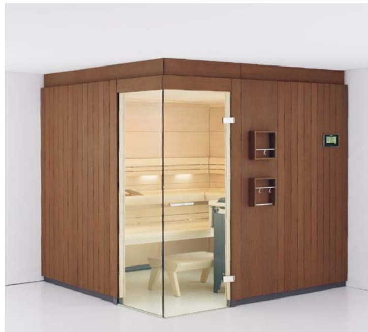
Sauna LOUNGE, external cladding wenge wood with glass corner, system panel for storage and towel, clothes hooks and TOUCHCONTROL control unit.

trol unit (page 134). The hemlock internal cladding may be classically designed or feature panelling as shown here. In addition, a wide range of additional fittings is available: backlighting for the back rests can conjure up a whole new atmosphere in the cabin. The AQUAVIVA light and sound panel, the variations provided by the COLOURED LIGHT or the contemplative STARRY SKY will also lend your dream sauna a personal note. Information on further beautiful and convenient additional products is available in our extra section starting on page 106.