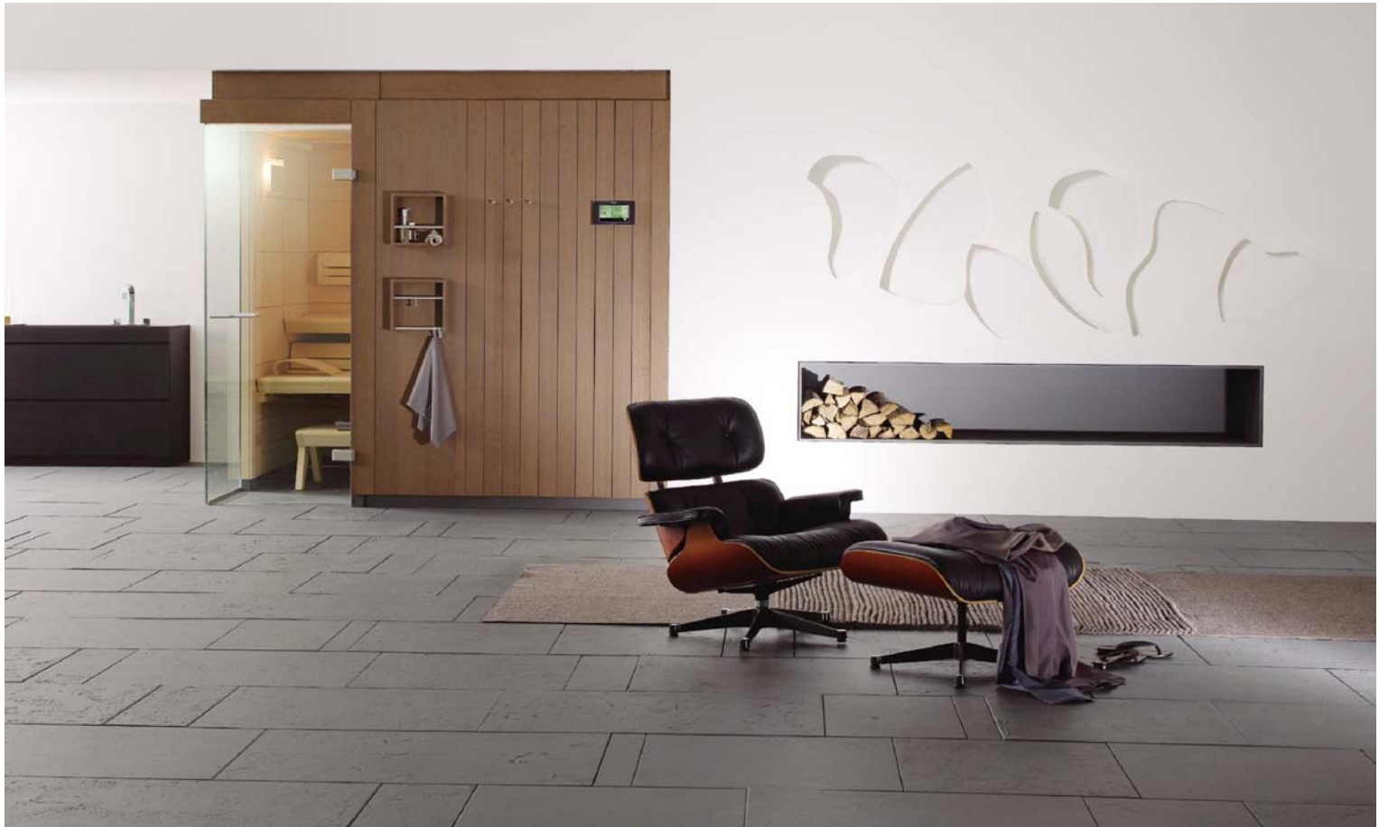
LOUNGE sauna, external cladding wenge wood with glass corner, system panel for storage and towel, clothes hooks and TOUCHCONTROL control unit.