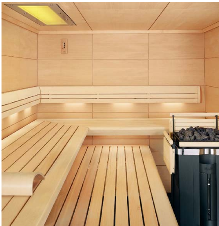
LOUNGE sauna, internal cladding hemlock panels, COLOURED LIGHT with LIFTLIGHT, SUNSET indirect lighting and MAJUS heater.

A model we have sweated long and hard over. In the case of LOUNGE, building a sauna to the highest standards has involved placing a particular emphasis on the highest possible quality of interior design. For this reason, the only wood we were prepared to consider for the wall cladding was pure and knotless hemlock. Whether used in the generous panelling seen here or in the classic SOFTLINE profile, the wood from this Canadian hemlock fir creates a elegant look no other wood can match, as well as providing a salubrious bathing climate. The successful combination of chic and sensible elements has resulted in a sauna which is ready to show you how great it is to work up a sweat. Something best done on a regular basis.