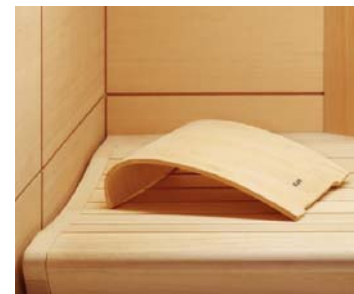
LOUNGE head rest.