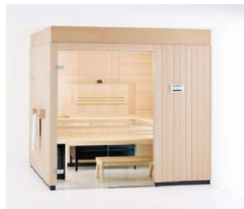
LOUNGE sauna with glass front.