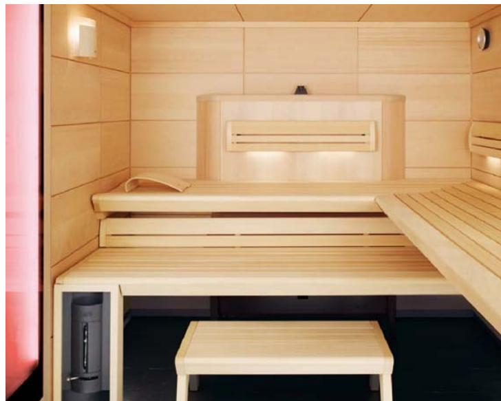
Sauna LOUNGE, internal cladding hemlock panels, BONATHERM VS SANARIUM®, SUNSET indirect lighting.

these decisions for you: clear forms, simple elegance, perfect workmanship are the order of the day here. A "Zen inspired" interior, providing emotional relaxation, even if plenty of exciting innovations are in evidence. Benches which seem to float on air. Back rests featuring mitre cut corners. Avant-garde style head rests, made from a single piece of wood. Further innovations include the splendid door handle and a light made from wood and glass. The harmonious coordination of all the elements involved generates a roundly balanced mood which enjoys the comfortable support of high-quality technology.