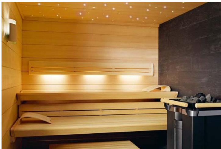
Internal cladding in horizontal hemlock panels, POLAR STARRY SKY, SUNSET indirect lighting and SANARIUM® MAJUS heater.

A highlight deserving your full attention. The interior cladding of the LOUNGE Q features hemlock panelling which extends across the entire length of the sauna. This lends the interior a particularly high-quality character and guarantees you the most pleasant of sauna bathing experiences. Only one thing now remains which can make a LOUNGE even more stylish: your own four walls. We mean that quite literally. On request, we will be happy to integrate your sauna into the spatial surroundings of your own home in a completely individual manner. The version shown features a glass front and has been amalgamated with an existing natural stone wall to ensure harmonious integration into the surrounding ambiance. Relaxation does not get any better than this.