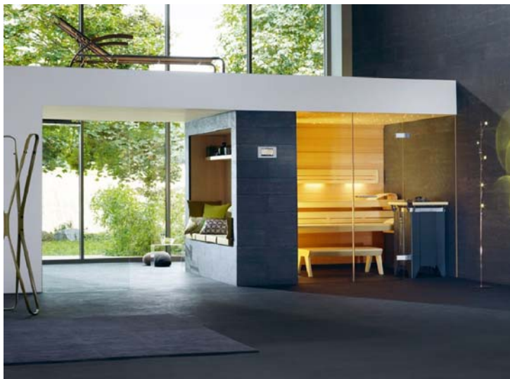
LOUNGE Q Sauna with glass front and TOUCHCONTROL control unit.